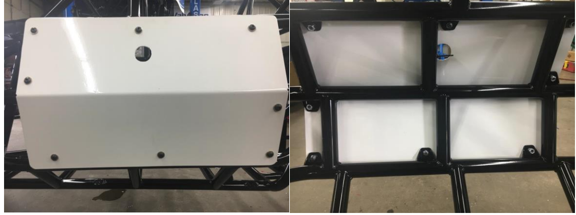
APPROVED FOR COMPETITION: INDIVIDUAL DOOR BAR CLAMPS/BOLT ON PLATE

A minimum of three (3) fabricated 1/8" (.125") magnetic steel tabs and 3/8" Allen button head bolts required across top of the intrusion plate, a minimum of three (3) fabricated 1/8" (.125") magnetic steel tabs and 3/8" Allen button head bolts required across the bottom of the plate, and one (1) fabricated 1/8" (.125") magnetic steel tabs and 3/8" Allen button head bolt in each in the middle front and middle rear of intrusion plate.